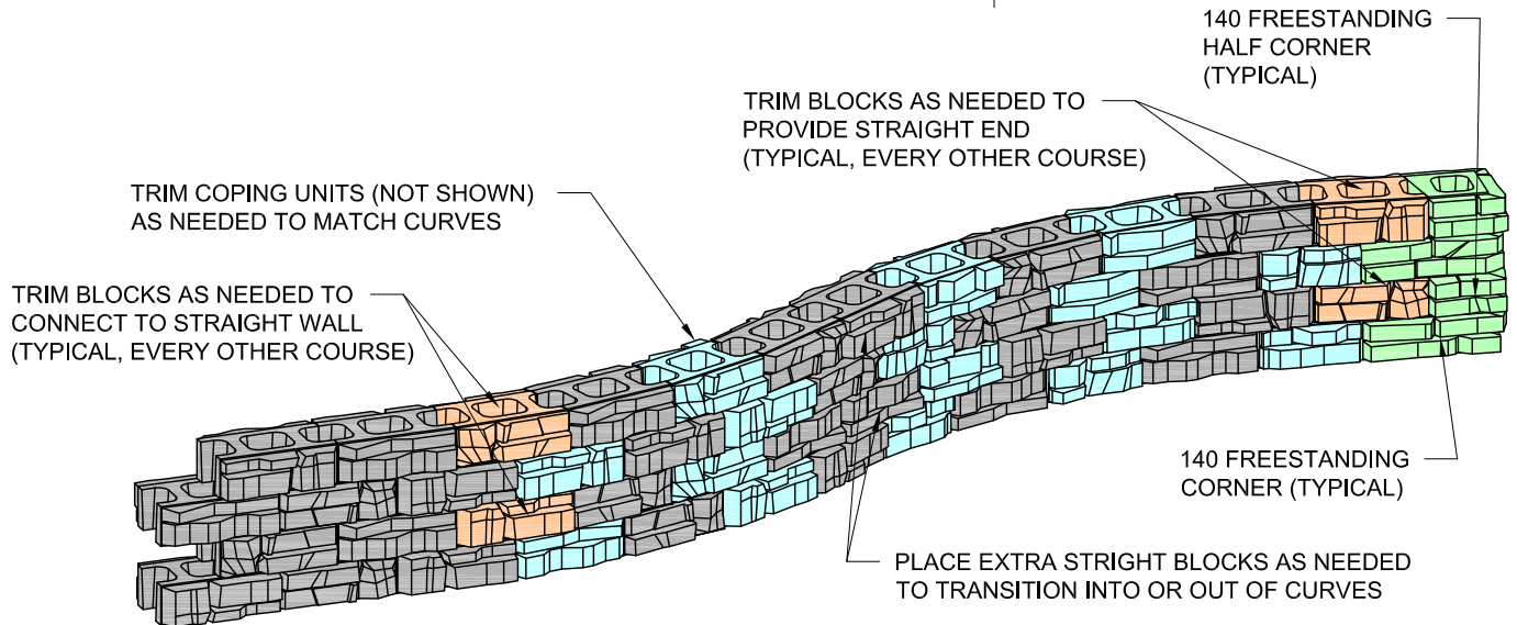
TRANSITION IN AND OUT OF CURVES

DRAWN BY: J. Johnson APPROVED BY: DATE: 01-19-10 SHEET NO.: 1 of 1